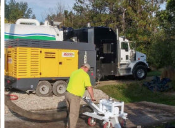
High pressure air and vacuum system