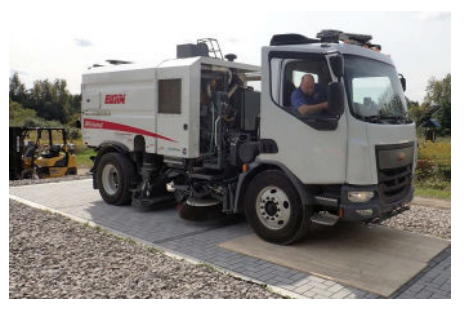
True vac machine