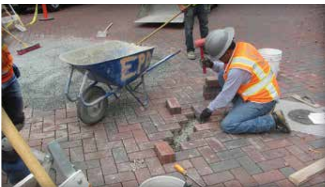
Figure 4. Reinstatement using the same pavers continues following the existing herringbone paving pattern.