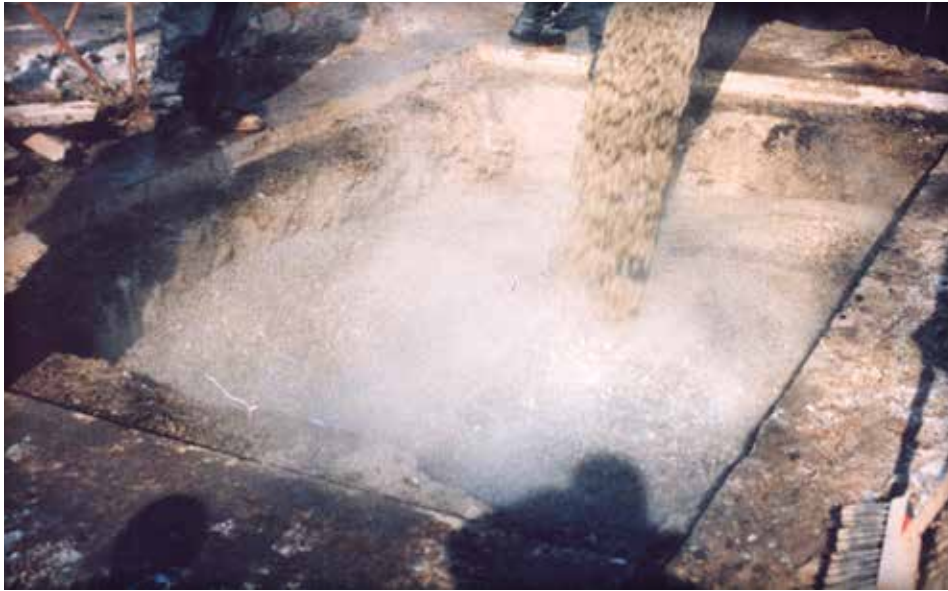
Figure 8. Low density concrete fill (unshrinkable fill) poured into a utility trench from a ready-mix concrete truck.

reinstated units are knitted into existing ones through the interlocking paving pattern and sand filled joints. Besides providing a pavement surface without cuts, the joints distribute loads by shear transfer. The joints allow minor settlement in the pavers caused by discontinuities in the base or soil without cracking.