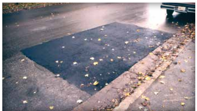
Figure 7. Pavement damage from settlement and shrinkage of cold patch asphalt.

Figures 2, 3, 4, 5 and 6 show the process of repair and illustrate the continuity of the paver surface after it is completed. The