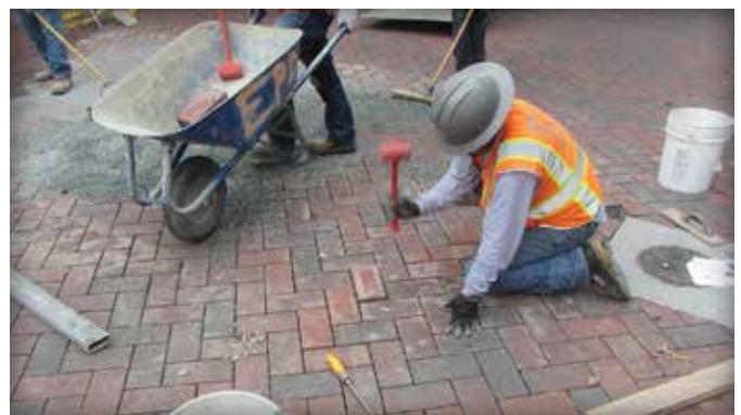
Figure 5. The final paver is inserted, the reinstated area compacted, joints filled, and compacted again. There are not cuts or damage to the pavement surface.