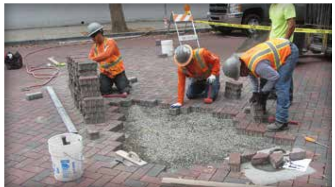
Figure 3. Once smoothed and joined with undisturbed materials at the opening perimeter, the bedding receives concrete pavers.