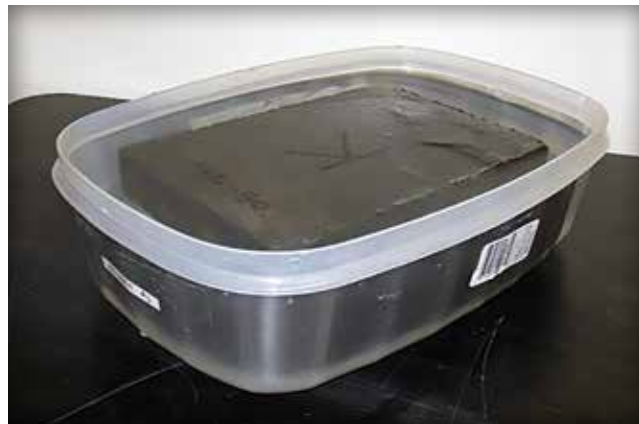
Figure 3. Test specimen from a slab immersed in a 3% saline solution ready for exposure to laboratory freeze-thaw cycles.

Segmental concrete paving slabs are sometimes mistakenly called concrete pavers or simply pavers. This has led to past misapplication of paving slabs in areas with substantial vehicular loads where interlocking concrete pavers should have been used. While concrete pavers and paving slabs are used in pedestrian applications, slabs are primarily for pedestrian use and limited vehicular traffic. Very large and thick slabs (called mega-slabs or large format paving units) have been used in some urban vehicular