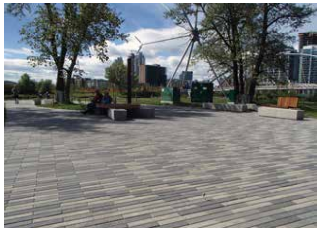
Figure 1. Concrete paving slabs can create certain moods and enhance the character of a project.