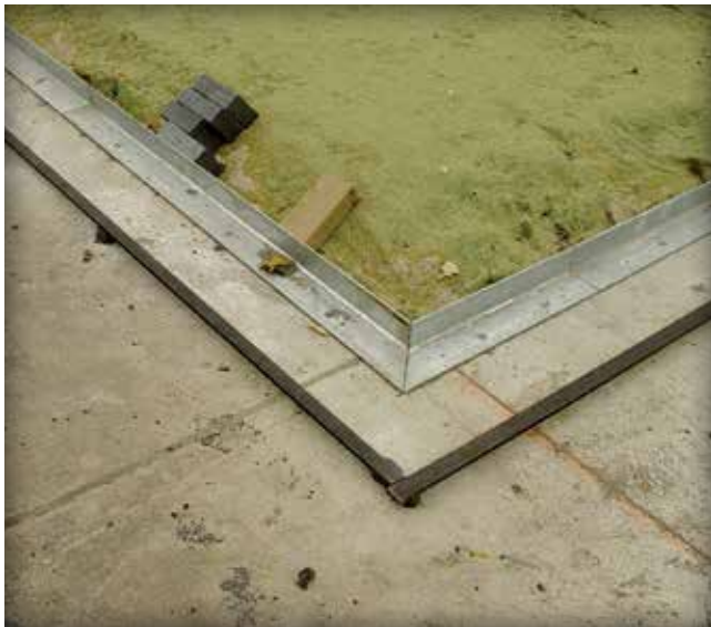
Figure 17. On larger projects, thick steel screed bars are placed on the concrete base to ensure a uniform bitumen-sand bedding thickness.