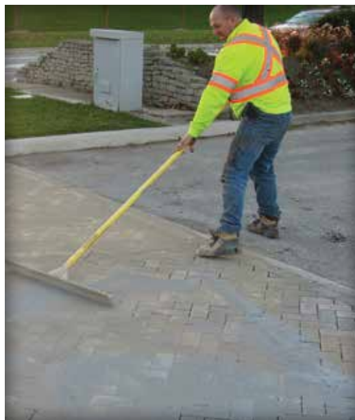
Figure 11. Sweeping in joint sand

The hot bitumen-sand bedding layer is placed, screeded to about \frac{3}{4} in. (20 mm) thick and compacted while remaining above 250° F (120° C) (Figures 4 and 5). This layer typically compacts about \frac{1}{8} in. (3 mm). The depth of this layer must be consistent. If the area does not have a curb to support a screed, screed bars are placed directly on the concrete base to guide the screed.