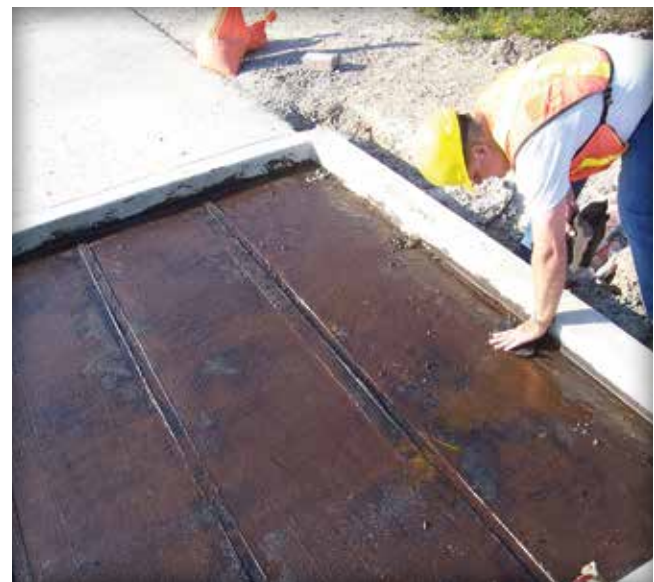
Figure 3. Confirming the tack coat has cured and is no longer wet to the touch.