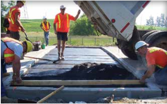
Figure 4. The hot bitumen-sand bedding material is dumped from a truck onto the concrete base.