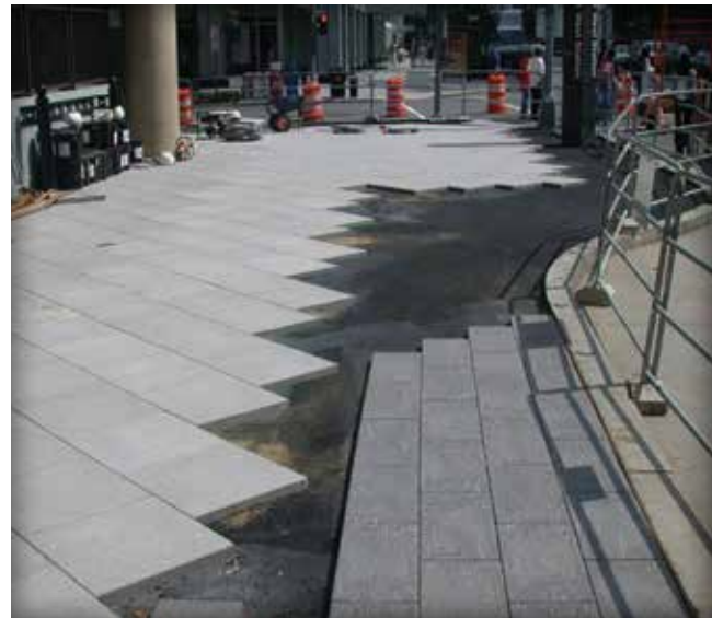
Figure 18. Paving slabs adhered to a bitumen-sand bedding in a Washington, DC, sidewalk.