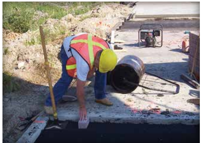
Figure 7. The compacted bedding elevation at the edge is checked with a paver.