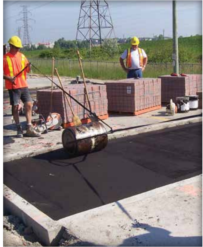
Figure 14. A water-filled roller compactor for compacting the bitumen-sand bedding.

Specialty Tools —Some specialty tools are required to successfully install bitumen-sand set pavers. For example, Figure 14 shows a roller modified with a long handle welded or bolted to the frame. The drum of the roller should be smooth with no rust, preferably with sharp edges (not rounded). Other specialty tools are shown in Figures 15, 16 and 17.