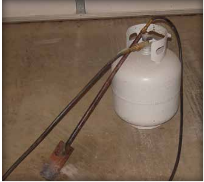
Figure 16. Occasionally, uneven bedding surface occurs and it is necessary to re-heat the bitumen-sand bedding with a propane heater tool.