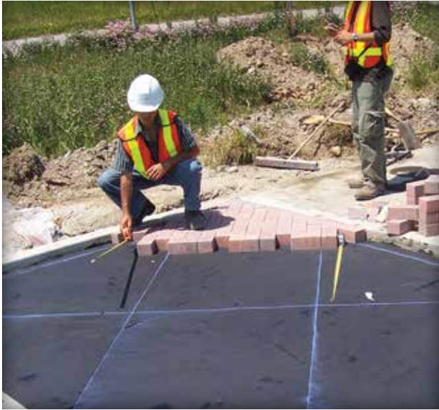
Figure 10. Cut pavers are added along the edges.

Best application results are typically achieved using a synthetic paint roller with a short nap. Once applied the tack coat should not be disturbed and should be allowed to cure before covering with the setting bed material. As the asphalt emulsion cures it should turn from a brown to black color (Figure 3). This may take a few hours depending on weather conditions. When using SS-1 and SS-1h asphalt emulsions the temperature should be between 70 and 160° F (20 to 70° C) to allow for proper curing. Asphalt tack coats are recommended for vehicular applications. They are typically not required in pedestrian applications.