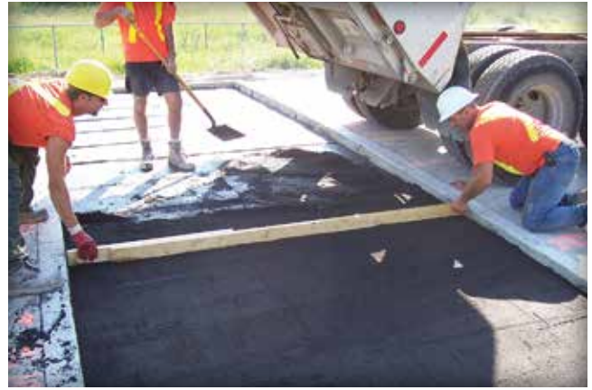
Figure 5. While the bitumen-sand is still hot, it is screeded to an uncompacted thickness of about \frac{3}{4} in. (20 mm).