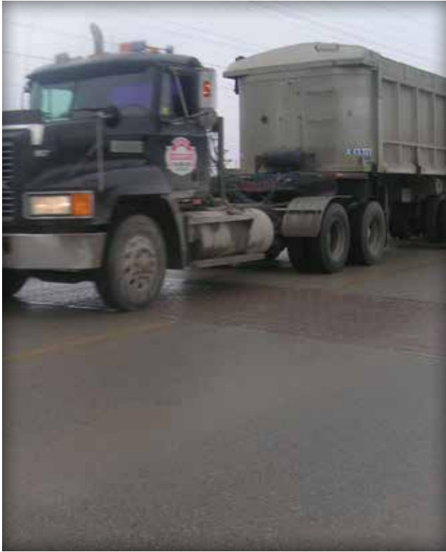
Figure 13. Crosswalk in use under heavy traffic.

ers are in place including cut units, sand is swept into the joints and pavers are compacted until the joints are full (Figures 11 and 12). For more efficient work, sand sweeping and compaction can be simultaneous. Unlike sand-set pavers, there is no need to compact the pavers without sand in the joints first. When completed, the pavement can accept traffic loading immediately (Figure 13).