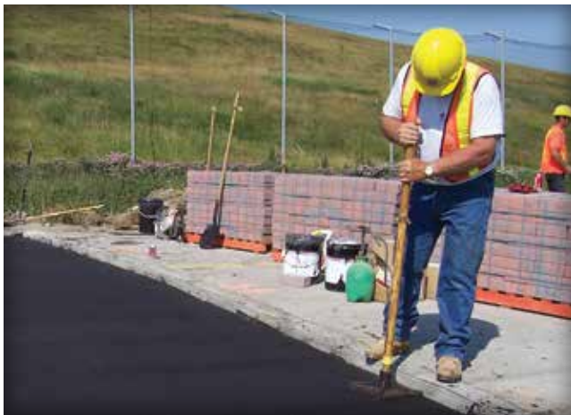
Figure 6. A hand tamper is used to compact in areas that cannot be reached with the roller compactor.