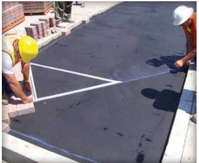
Figure 9. Perpendicular chalk lines are snapped and the pavers placed on the adhesive after the neoprene-asphalt adhesive dries (cloudy black surface).