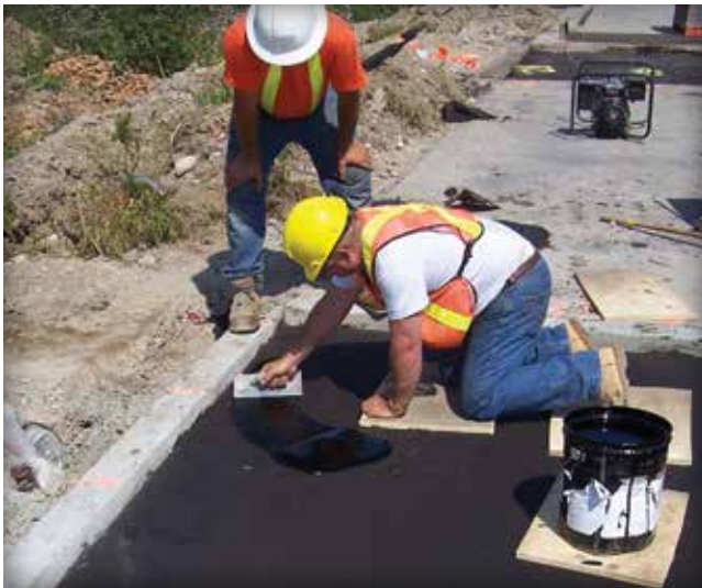
Figure 8. After the bitumen-sand mix cools, a 2% neoprene-asphalt adhesive is applied. The material can be trowel-applied as shown here. Adhesives with a lower viscosity can be spread with a squeegee.