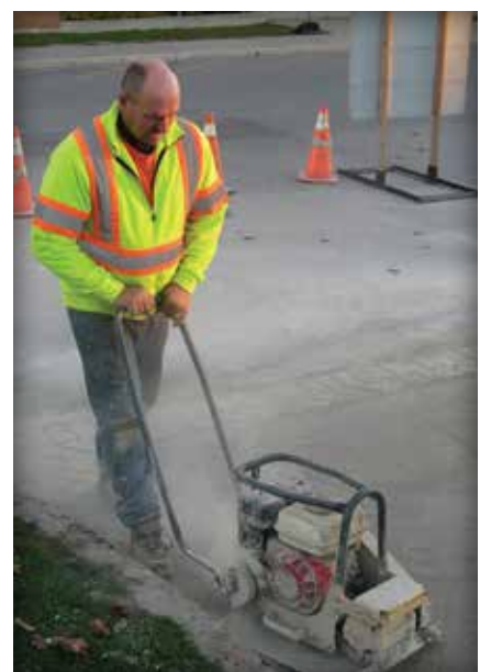
Figure 12. Once the pavers are in place, the joints are filled with dry joint sand and the surface is compacted.

A thin layer of neoprene-asphalt adhesive is then applied with a squeegee to the top of the bedding layer, and allowed to cure (typically 1 to 2 hours). Adhesives with a high viscosity are applied with a straight edged towel as shown in Figure 8. Adhesives with a low viscosity can be applied with a squeegee. The adhesive takes a hazy appearance when ready to mark baselines and place the concrete pavers (Figure 9). Only enough adhesive should be applied that will be covered with pavers in a day's work. Figure 10 shows the paver installation. Once the pavers are placed on the adhesive, they are very difficult to remove. If removed, they can pull up the adhesive and bitumen-sand bedding under the paver. Once all the pav-