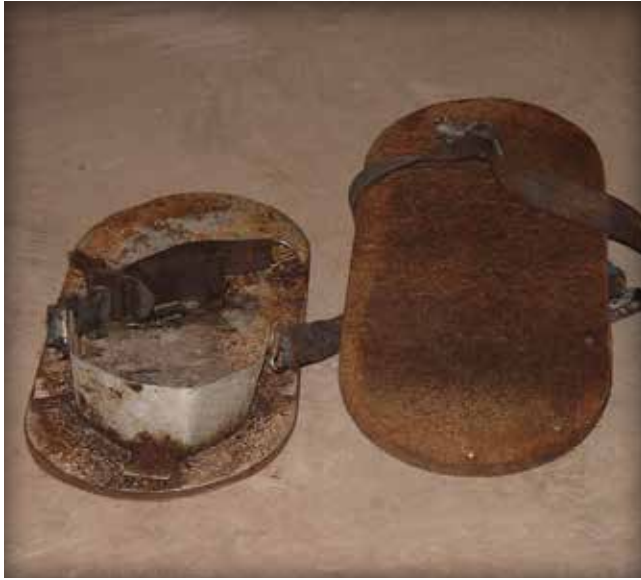
Figure 15. Walking on the hot bitumen-sand bedding with regular construction grade, steel-toed boots is discouraged. For limited walking on this layer, workers should wear boot sole covers shown here that resist damage and better distribute weight to prevent dentations.