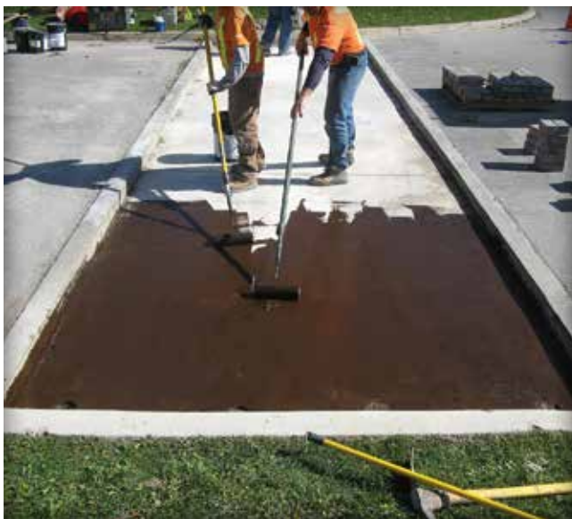
Figure 2. Emulsified asphalt tack coat is applied to a concrete base prior to applying the bitumen-sand mix.