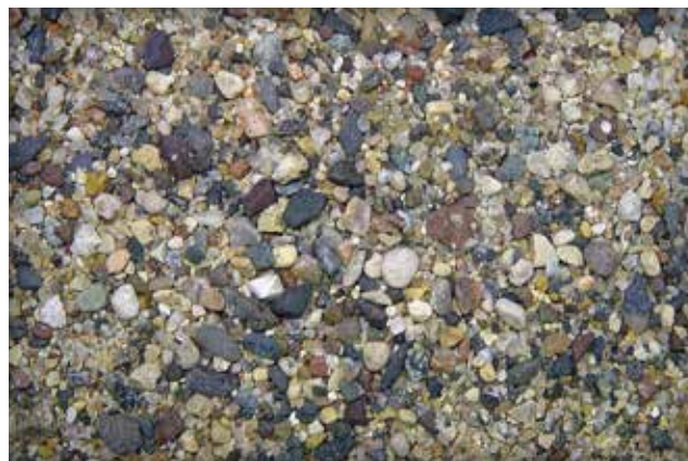
Figure 3. Example of sand from the ICPI bedding sand test program with a total combined percentage of sub-angular and sub-rounded particles equal to 65% according to ASTM D2488

Recommended Material Properties —Table 3 lists the primary and secondary material properties that should be considered when selecting bedding sands for vehicular applications. Bedding sands may exceed the gradation requirement for the maximum amount passing the No. 200 (0.075 mm) sieve as long as the sand meets degradation and permeability recommendations in Table 3. Micro-Deval degradation testing can be replaced with sodium sulfate or magnesium soundness testing as long as this test is accompanied by the other primary material property tests listed in Table 3. Other