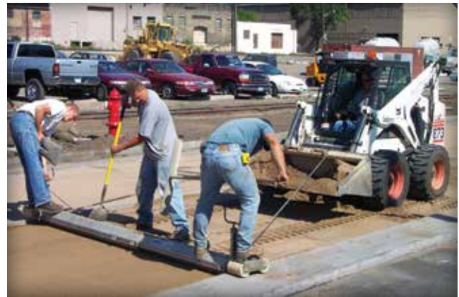
Figure 5. Mechanical screeding is the most efficient method of bedding sand installation

material properties listed, such as petrography and angularity testing are at the discretion of the specifier and may offer additional insight into bedding sand performance.