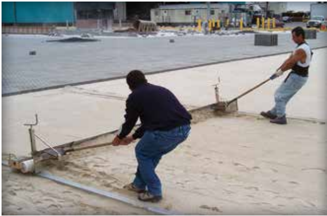
Figure 4. A two-man hand pulled screed