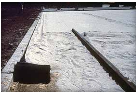
Figure 7. Woven geotextile used to contain bedding sand from migrating laterally. Visit www.icpi.org for detail drawings.

Interlocking concrete pavements should also be designed and constructed such that the bedding sand should not be able to migrate into the base, or laterally through the edge