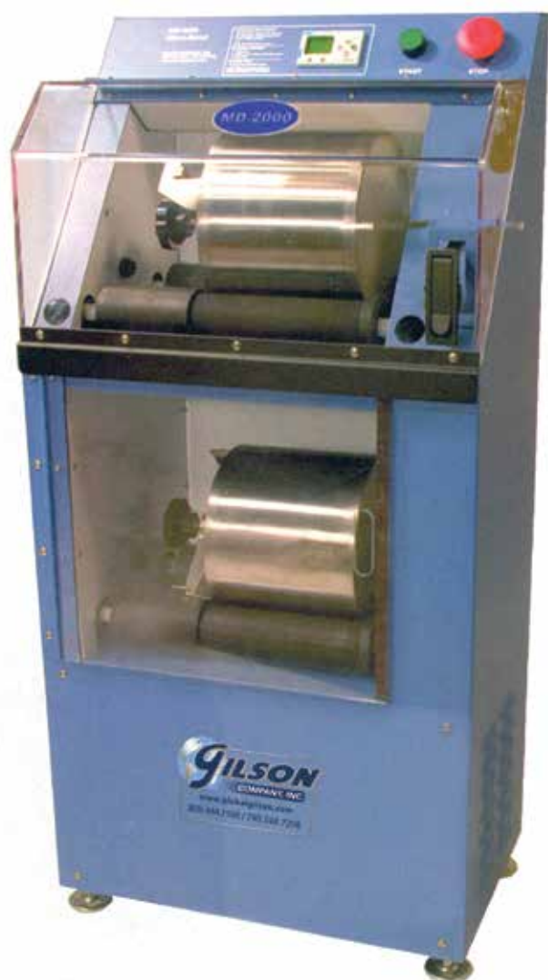
Figure 1. The Micro-Deval test apparatus.

The Micro-Deval test is evolving as the test method of choice for evaluating durability of aggregates in North America. Defined by CSA A23.2-23A, The Resistance of Fine Aggregate to Degradation by Abrasion in the Micro-Deval Apparatus and ASTM D7428 Standard Test Method for Resistance of Fine Aggregate to Degradation by Abrasion in the Micro-Deval Apparatus , the test method involves subjecting aggregates to abrasive action from steel balls in a laboratory rolling jar mill. In the CSA test method a 1.1 lb (500 g) representative sample is obtained after washing to remove the No. 200 (0.080 mm) material. The sample is saturated for 24 hours and placed in the Micro-Deval stainless steel jar with 2.75 lb (1250 g) of