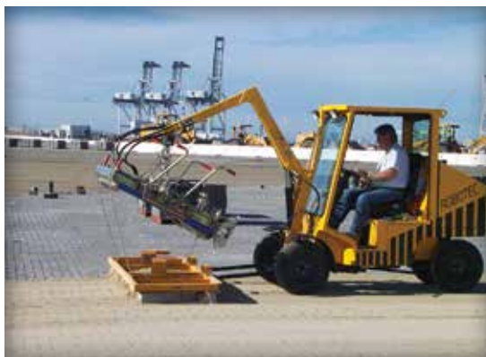
Figure 12. Sweeping jointing sand across the pavers is done after the initial compaction of the concrete pavers.

Whenever possible cut pavers exposed to tire traffic should be no smaller than one-third of a full paver and all cut pavers should be placed in the laying pattern to provide a full and complete paver placement prior to initial compaction. Coursing can be modified along the edges to accommodate cut pavers. Joint lines are straightened and brought into conformance with this specification as laying proceeds and prior to initial compaction. Sometimes the pattern may need to be changed to ensure that this can be achieved. However, specifiers