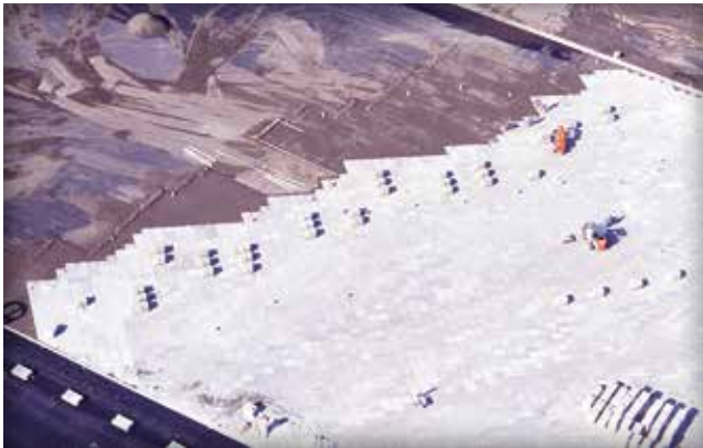
Figure 7. Maintaining an angular laying face that resembles a saw-tooth pattern facilitates installation of paver clusters.