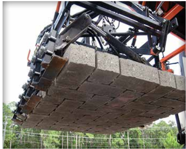
Figure 3. A cluster of pavers (or layer) is grabbed for placement by mechanical installation equipment. The pavers within the cluster are arranged in the final laying pattern as shown under the equipment.

A key component in the plan is a method statement by the manufacturer that demonstrates control of paver dimensional tolerances. This includes a plan for managing dimensional tolerances of the pavers and clusters so as to