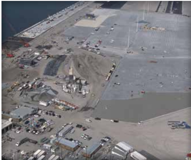
Figure 14. The Port of Oakland, California, is the largest mechanically installed project in the western hemisphere at 4.7 million sf (470,000 m 2 ).

The GC should insure that no vehicles other than those from the subcontractor's work are permitted on any pavers until completion of paving. This requires close coordination of vehicular traffic with other contractors working in the area. After the paver installation subcontractor moves to another area of a large site, or completes the job and leaves, he has no control over protection of the pavement. Therefore the GC should assume responsibility for protecting the completed work from damage, fuel or chemical spills. If there is damage, it should be repaired to its original condition, or as directed by the engineer. When the job is completed, all equipment, debris and other materials are removed from the pavement.