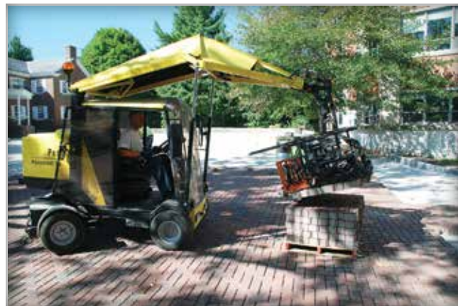
Figure 1. Mechanical installation of interlocking concrete pavements (left) and permeable units (right) is seeing increased use in industrial, port, and commercial paving projects to increase efficiency and safety.