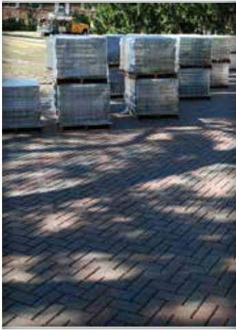
Figure 2. Bundles of ready-to-install pavers for setting by mechanical equipment. Bundles are often called cubes of pavers.

sand stabilization materials. ICPI Tech Spec 11–Mechanical Installation of Interlocking Concrete Pavements (ICPI 2015) should be consulted for additional information on design and construction with this paving method. Other references include American Society for Testing and Materials or the Canadian Standards Association for the concrete pavers, sands, and joint stabilization materials, if specified. Placement of the base, drainage and related