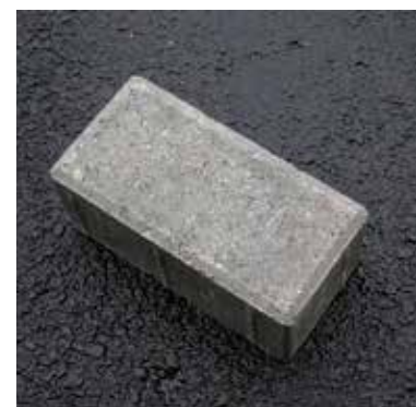
Figure 4. Spacer bars are small nibs on the sides of the pavers that provide a minimum joint spacing into which joint sand can enter.

The ASTM and CSA freeze-thaw deicing salt tests for freeze-thaw durability requires several months to conduct. Often the time between manufacture and time of delivery to the site is a matter of weeks or even days. In such cases, the engineer may consider reviewing freeze-thaw deicing salt test results from pavers made for other projects with the same mix design. These test results can be used to demonstrate that the manufacturer can meet the freeze-thaw durability requirements in ASTM C936 and CSA A231.2. Once this requirement is met, the engineer should consider