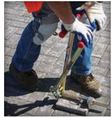
Figure 11. During initial compaction, cracked pavers are removed and immediately replaced with whole units.

with rubber hammers and alignment bars. Maximizing interlock among clusters and throughout the pavement surface is assisted by the placement pattern of the clusters. To help maximize the interlock between clusters, installations should avoid straight, continuous bond lines throughout the pavement surface. Rotating clamps on mechanical placement equipment facilitate easier clusters placement in patterns that do not create continuous joint lines.