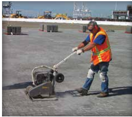
Figure 10. Initial compaction sets the concrete pavers into the bedding sand.