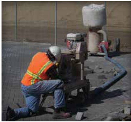
Figure 9. Edge pavers are saw cut to fit against a drainage inlet.