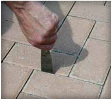
Figure 14. A simple test with a putty knife checks consolidation of the joint sand.

should note that some patterns cannot be changed because of the paver shape and some paver cuts will need to be less than one-third.