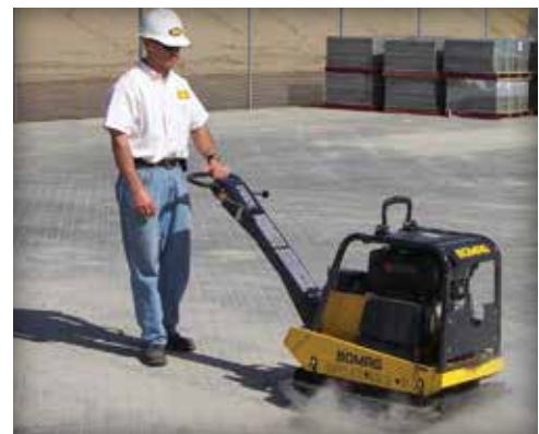
Figure 13. Final compaction should consolidate the sand in the joints of the concrete pavers.