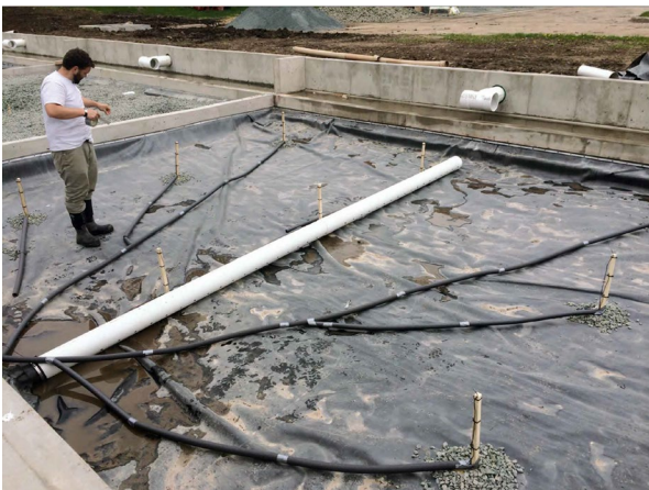
Installation of temperature sensors.

Previous research papers authored by the principal investigator indicated substantial pollutant reductions from these no-infiltration permeable pavements. This expanded their use by the Wisconsin Department of Natural Resources. The papers indicated that the assemblies included sensors placed at the top, middle, and bottom of these three pavements to measure temperature. This provided an investigative opportunity. See the two figures below.