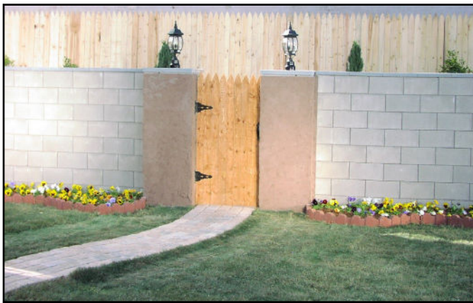
Figure 3— A Mortarless Garden Wall Application