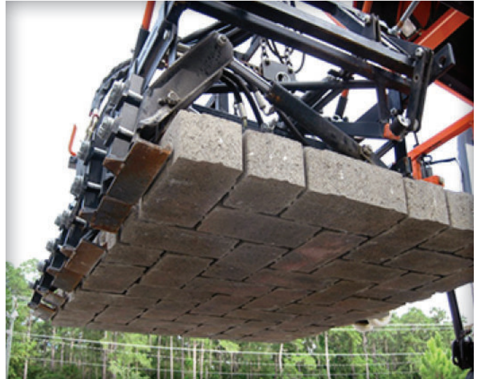
Figure 3. A cluster of pavers (or layer) is grabbed for placement by mechanical installation equipment. The pavers within the cluster are arranged in the final laying pattern as shown under the equipment.

Transportation planning for timely delivery of materials is a key element of large interlocking concrete pavement projects. Therefore, the manufacturer should include a storage and retrieval plan at the factory and designate transportation routes to the site. In addition, there is a description of the transportation method(s) of pavers to the site that incurs no shifting or damage in transit that may result in interference with and delay of their installation. The manufacturer's portion of the quality control plan includes typical daily production and delivery rates to the site for determining on-site testing frequencies.