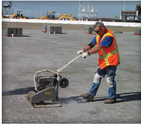
Figure 10. Initial compaction sets the concrete pavers into the bedding sand.