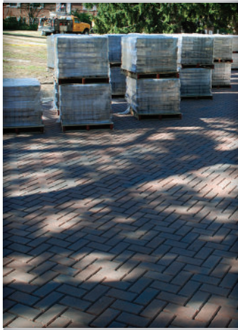
Figure 2. Bundles of ready-to-install pavers for setting by mechanical equipment. Bundles are often called cubes of pavers.