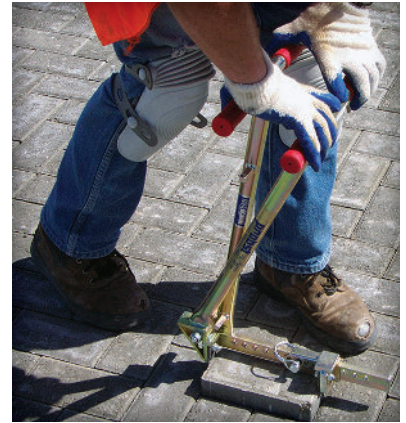
Figure 11. During initial compaction, cracked pavers are removed and immediately replaced with whole units.

placement pattern of the clusters. To help maximize the interlock between clusters, installations should avoid straight, continuous bond lines throughout the pavement surface. Rotating clamps on mechanical placement equipment facilitate easier clusters placement in patterns that do not create continuous joint lines.