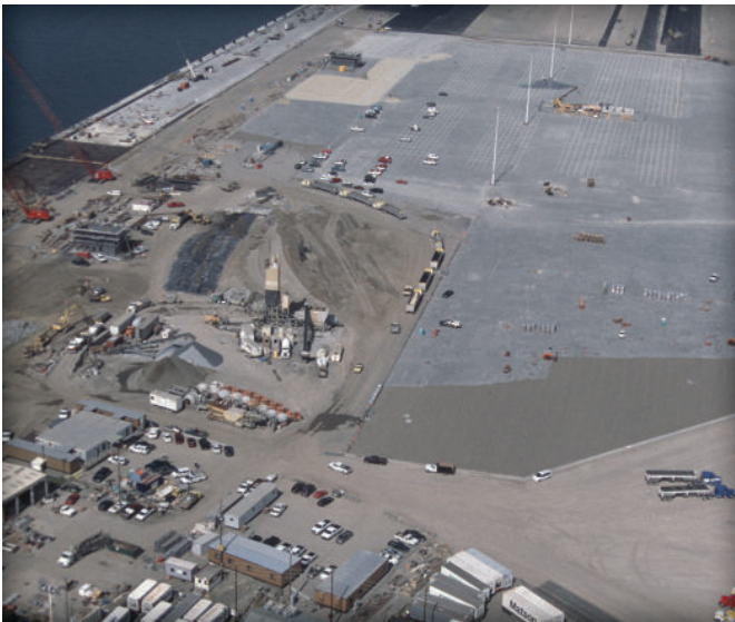
Figure 14. The Port of Oakland, California, is the largest mechanically installed project in the western hemisphere at 4.7 million sf (470,000 m 2 ).

the paver installation subcontractor moves to another area of a large site, or completes the job and leaves, he has no control over protection of the pavement. Therefore the GC should assume responsibility for protecting the completed work from damage, fuel or chemical spills. If there is damage, it should be repaired to its original condition, or as directed by the engineer. When the job is completed, all equipment, debris and other materials are removed from the pavement.