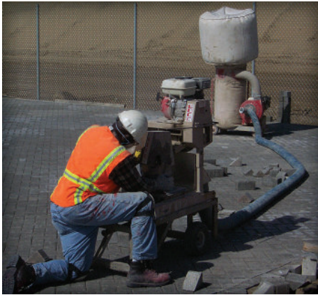
Figure 9. Edge pavers are saw cut to fit against a drainage inlet.