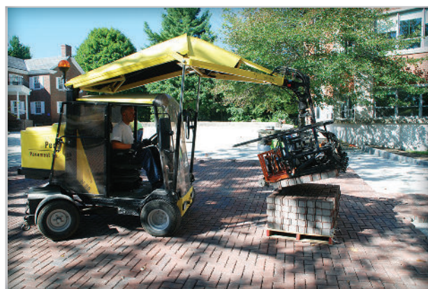
Figure 1. Mechanical installation of interlocking concrete pavements (left) and permeable units (right) is seeing increased use in industrial, port, and commercial paving projects to increase efficiency and safety.