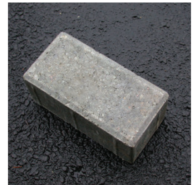
Figure 4. Spacer bars are small nibs on the sides of the pavers that provide a minimum joint spacing into which joint sand can enter.

The ASTM and CSA freeze-thaw deicing salt tests for freeze-thaw durability requires several months to conduct. Often the time between manufacture and time of delivery to the site is a matter of weeks or even days. In such cases, the