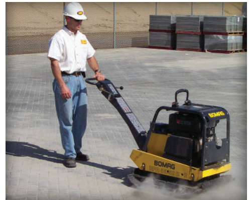
Figure 13. Final compaction should consolidate the sand in the joints of the concrete pavers.