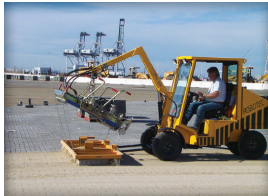
Figure 12. Sweeping jointing sand across the pavers is done after the initial compaction of the concrete pavers.

Whenever possible cut pavers exposed to tire traffic should be no smaller than one-third of a full paver and all cut pavers should be placed in the laying pattern to provide a full and complete paver placement prior to initial compaction. Coursing can be modified along the edges to accommodate cut pavers. Joint lines are straightened and brought into conformance with this specification as laying proceeds and prior to initial compaction. Sometimes the pattern may need to be changed to ensure that this can be achieved. However, specifiers should note that