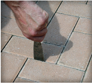
Figure 14. A simple test with a putty knife checks consolidation of the joint sand.

some patterns cannot be changed because of the paver shape and some paver cuts will need to be less than one-third.