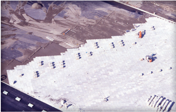
Figure 7. Maintaining an angular laying face that resembles a saw-tooth pattern facilitates installation of paver clusters.

as best practices. Other methods vary mainly in the techniques used for compaction of the pavers and joint sand installation. CMHA recommends using a vibrating plate compactor on concrete pavers for consolidation of bedding and joint sands.