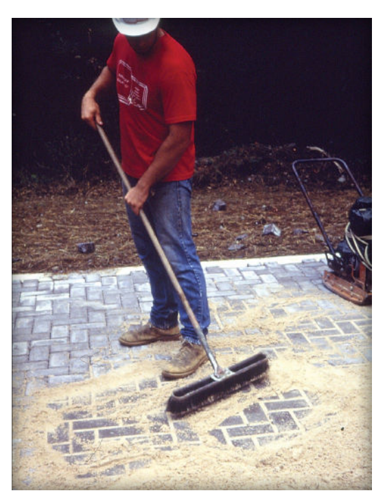
Figure 10. Spreading the joint sand.

Edge restraints are a key part of interlocking concrete pavements. By providing lateral resistance to loads, they maintain continuity and interlock among the paving units. Aluminum, steel, plastic, or concrete are typical edge restraints. Consult CMHA Tech Note PAV-TEC-003 on edge restraints for recommendations on applications and construction.