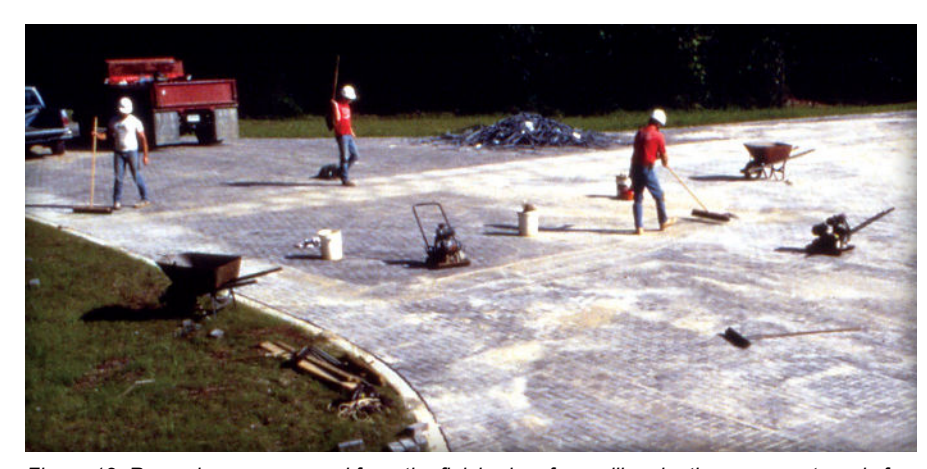
Figure 12. Removing excess sand from the finished surface will make the pavement ready for traffic.

Cut pavers should be used to fill gaps along the edge of the pavement. Pavers are cut with a double bladed splitter or a masonry saw. See Figure 8. A saw gives a smooth cut. All saws should have equipment to reduce the dust created, since it is know to contain high level of respirable crystaline