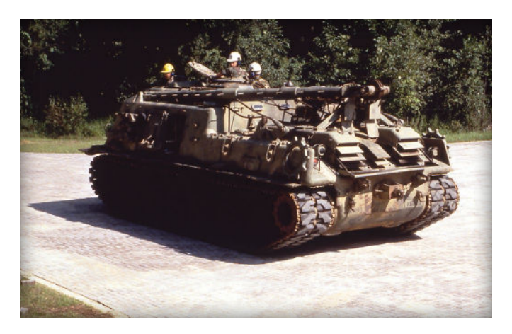
Figure 13. The completed paved area from Figure 12 receives tank traffic at the U.S. Army Proving Grounds in Aberdeen, Maryland.

Dry joint sand is spread into the joints and the pavers compacted again until the joints are full. See Figures 10 and 11. This may require two or three passes of the plate compactor. If the sand is wet, it should be spread on a clean, hard surface to dry before being spread on the pavers and compacted into the joints. Joint sand may be finer than the bedding sand to facilitate filling of the joints like a sand meeting ASTM C144 or CSA A179 requirements. See Table 6. Bedding sand also can be used to fill the joints, but it may require extra effort in spreading and compacting. Compaction should be within 6 ft (2 m) of an unrestrained edge or laying face. All pavers within 6 ft (2 m) of the laying face should have the joints filled and be compacted at the end of each day. Excess sand is then removed. See Figure 12. The remaining uncompacted edge can be covered