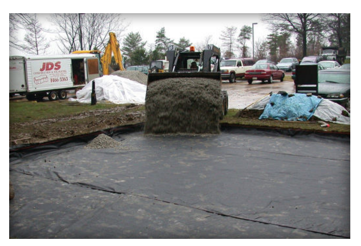
Figure 3. Application of the geotextile under aggregate base.

During and after excavation, the soil should be inspected