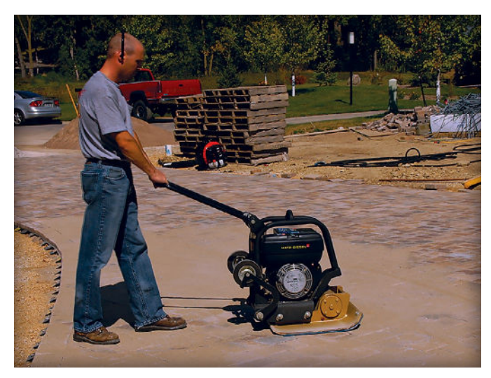
Figure 11. Vibrating sand into the joints.