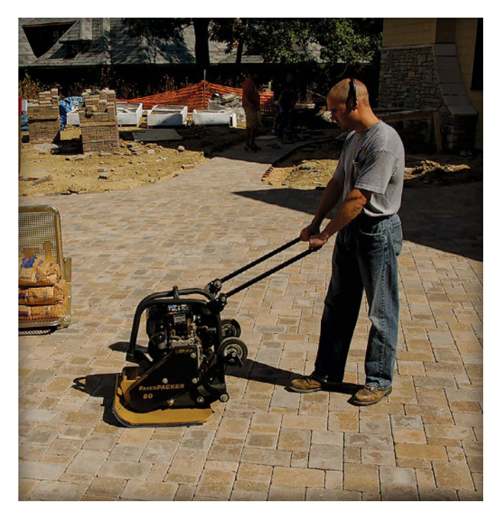
Figure 9. Compacting the pavers and bedding sand.

in. ( \pm 19 mm to \pm 13 mm). Maintaining consistent lift thickness during compaction will help achieve consistent density. Variation in final base surface elevations should not exceed \pm 3/8 in. ( \pm 10 mm) when tested with a 10 ft. (3 m) straightedge.