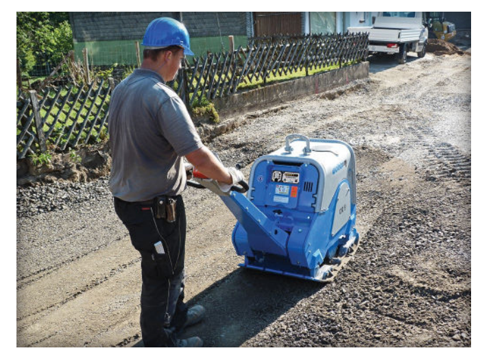
Figure 4. Base compaction with a reversible plate compactor.

geotextiles prevent the migration of soil into the aggregate base under loads, especially when saturated, thereby reducing the likelihood of rutting. When geotextiles are used they preserve the load bearing capacity of the base over a greater length of time than placement without them. Woven or non-woven fabric may be used under the base with a maximum apparent opening size of 0.60 mm as testing using ASTM D4751. Table 2 lists minumum requirements of geotextiles for soil separation. These requirements are from AASHTO M288 Standard Specification for Geotextile Specification for Highway Applications (AASHTO 2015). The minimum down slope overlap should be at least 12 in. (300 mm). Overlap requirements for low strength subgrades are detailed in Table 3.