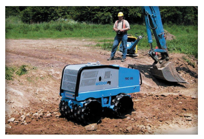
Figure 2. Compacting the soil subgrade.

an average mass loss no greater than 225 g/m² when subject to 28 freeze-thaw cycles, or no greater than 500 g/m² when subject to 49 freeze-thaw cycles.