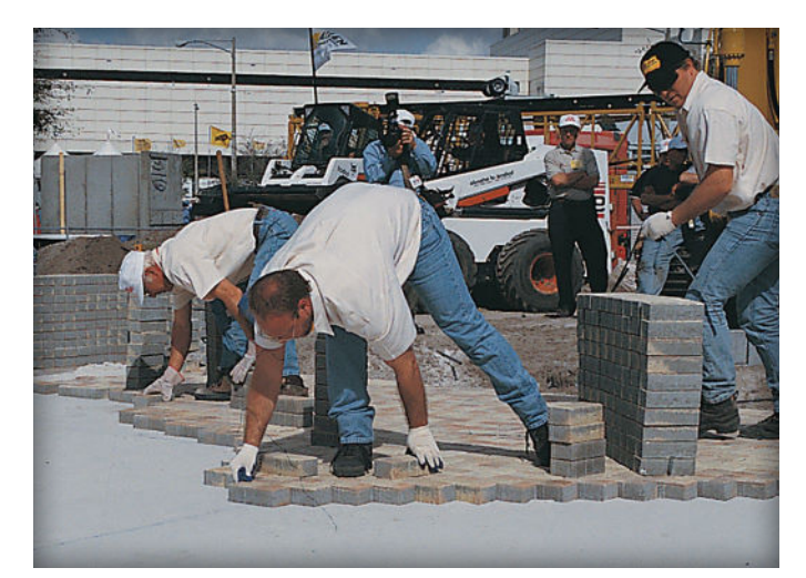
Figure 7. Placing the concrete pavers.

Many localities determine base thickness with the 1993 Guide for the Design of Pavement Structures published by the American Association of State Highway and Transportation Officials (AASHTO). The AASHTO procedure calculates the structural number (SN) of the strength coefficients of each base and pavement layer. The SN is determined by assessing the traffic loads, soils, and environmental factors (e.g., drainage, freeze-thaw). The layer coefficient recommended for 3^{1/8} in. (80 mm) thick pavers on 1 in. (25 mm) bedding sand is 0.44 per inch (25 mm), i.e., the SN = 4^{1/8} \times 0.44 = 1.82 . Base thicknesses can be readily determined by using the charts in Tech Note PAV-TEC-004–Structural Design of Interlocking Concrete Pavement for Roads and Parking Lots or CMHA Structural Design Software.