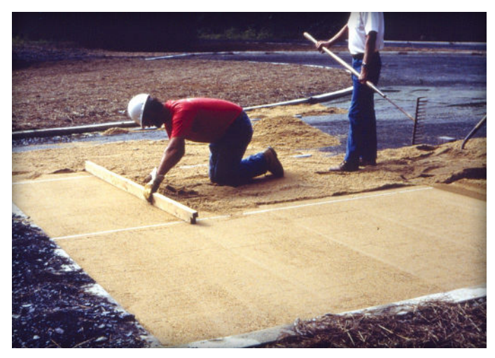
Figure 6a & 6b. Screeding the bedding sand.

with numerous freeze-thaw cycles, expansive soils, or very cold climates. A qualified civil engineer familiar with local soils and traffic conditions should be consulted to determine the appropriate base thickness for streets and heavy-duty, industrial pavements.