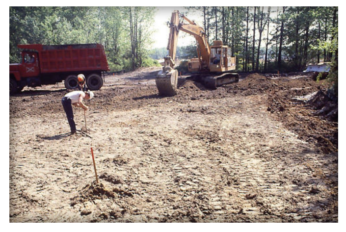
Figure 1. Excavation of the soil subgrade and placing grade stakes.

Concrete pavers made in Canada are required to meet requirements set forth by the Canadian Standards Association CSA-A231.2 Precast Concrete Pavers . This standard requires a minimum average cube compressive strength of 7,250 psi (50 MPa) or 5,800 psi (40 MPa) at delivery. Samples must meet dimensional tolerances for length and width of –1 to +2 mm and height at ±3.0 mm. Freeze-thaw durability is tested while samples are immersed in a 3% saline solution and subject to -15 degrees C as the lowest temperature. Samples must have